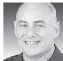
General John Kelly U.S. Marine Corps (RET)

Retired four-star General John Kelly is a 45-year Marine veteran who headed the U.S. Southern Command, where he focused on U.S. border security, organized crime, terrorist organizations and drug traffickers in his Latin American region for more than three years.