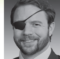
The Honorable Dan Crenshaw United States House of Representatives Invited