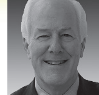
The Honorable John Cornyn United States Senate Invited